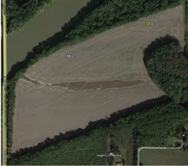
Overhead view of Moonbeam parcel and test well locations. TW-2 is noted in yellow.